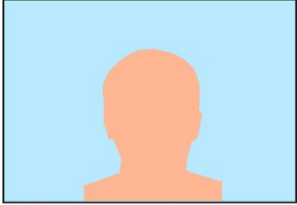
Take a picture approximately like this sample...

Please use your digital camera or the WEBCAM attached to your computer to take a photo of yourself approximately the same format as the this picture sample below. Please take the picture with a plain background, and set the camera image resolution to no greater than 800 by 600 pixels. We accept digital images in JPEG or PNG format. Almost all the digital cameras on the market support at least one of these formats.