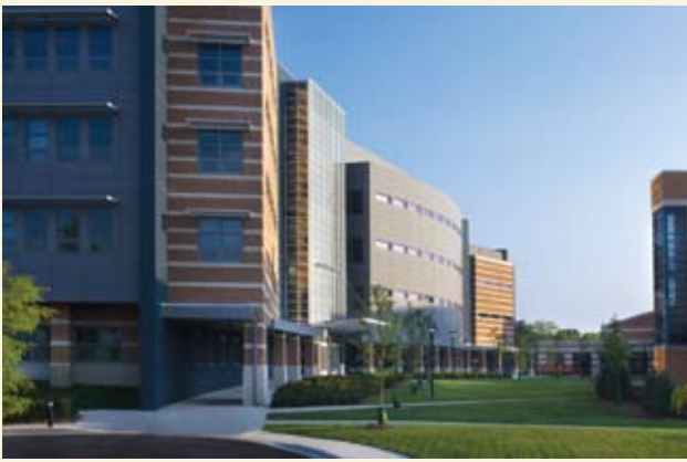
The Universities at Shady Grove