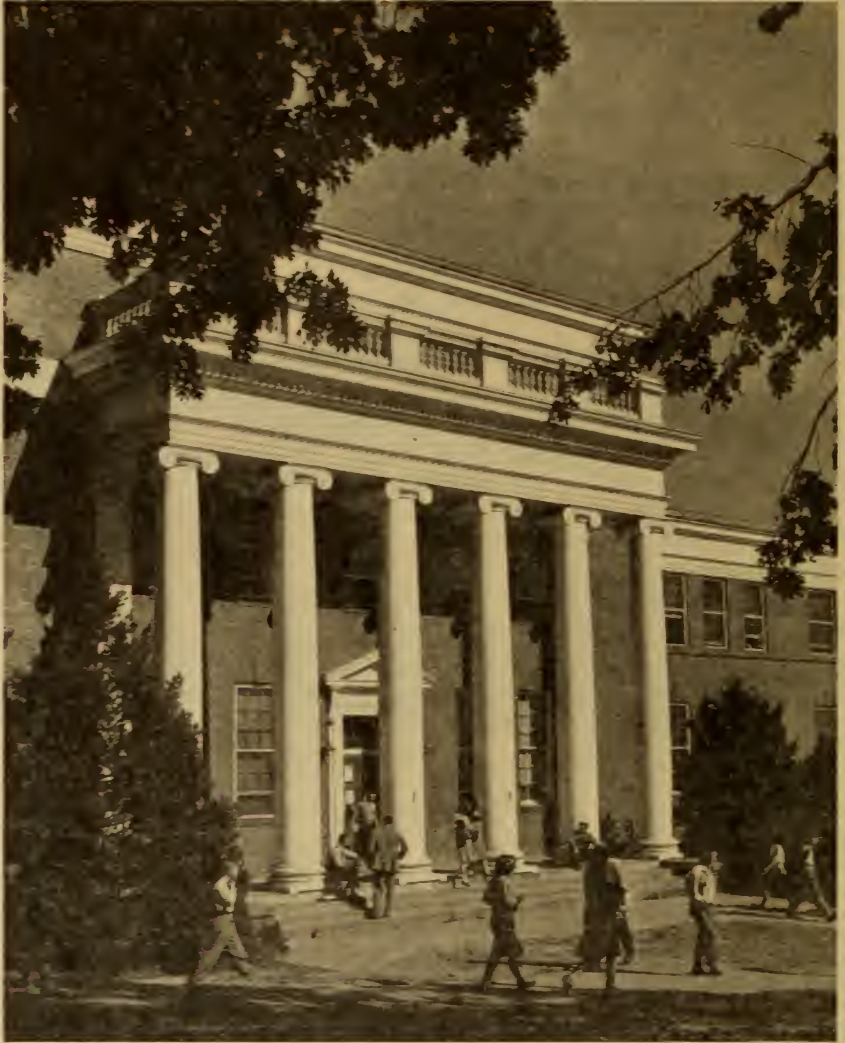
Campus Building, University of Maryland College Park, Maryland