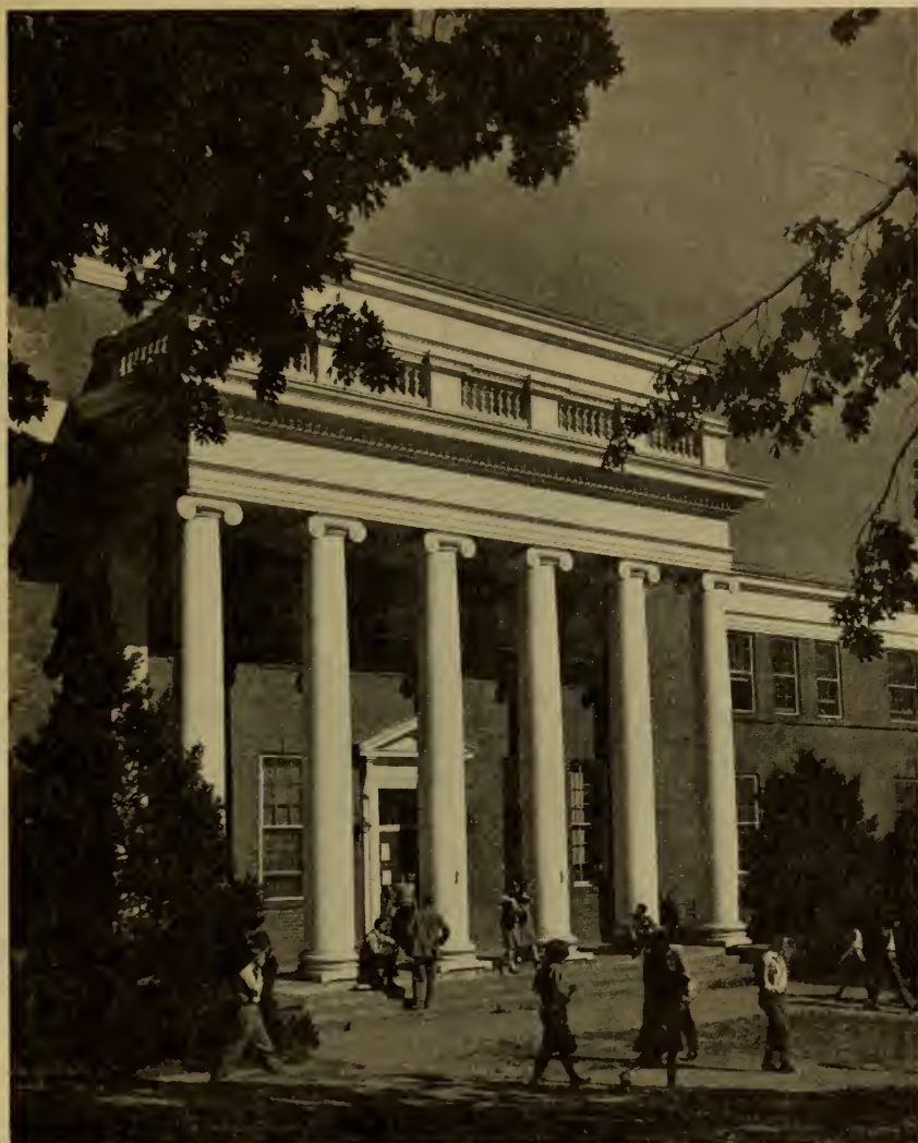
Campus Building, University of Maryland College Park, Maryland