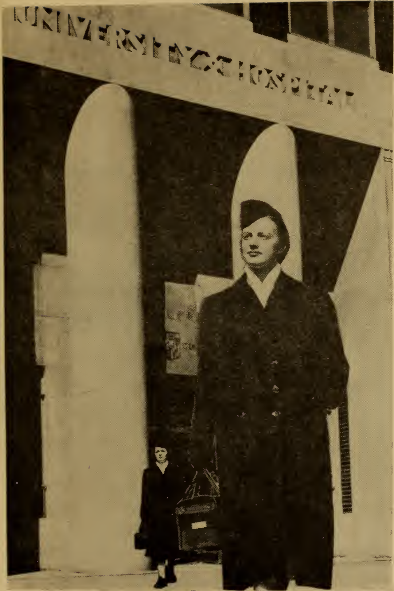
A well prepared nurse must have knowledge and experience in all phases of community health.