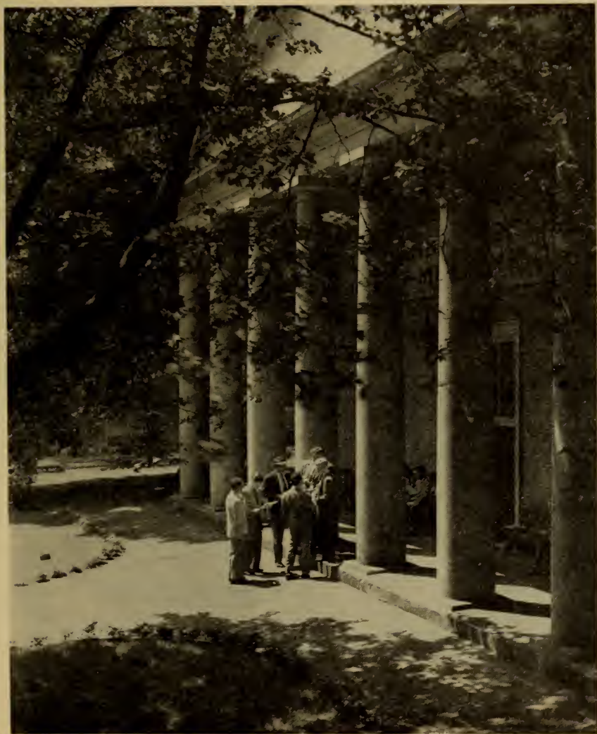
Original and Present Medical School Building (1812)