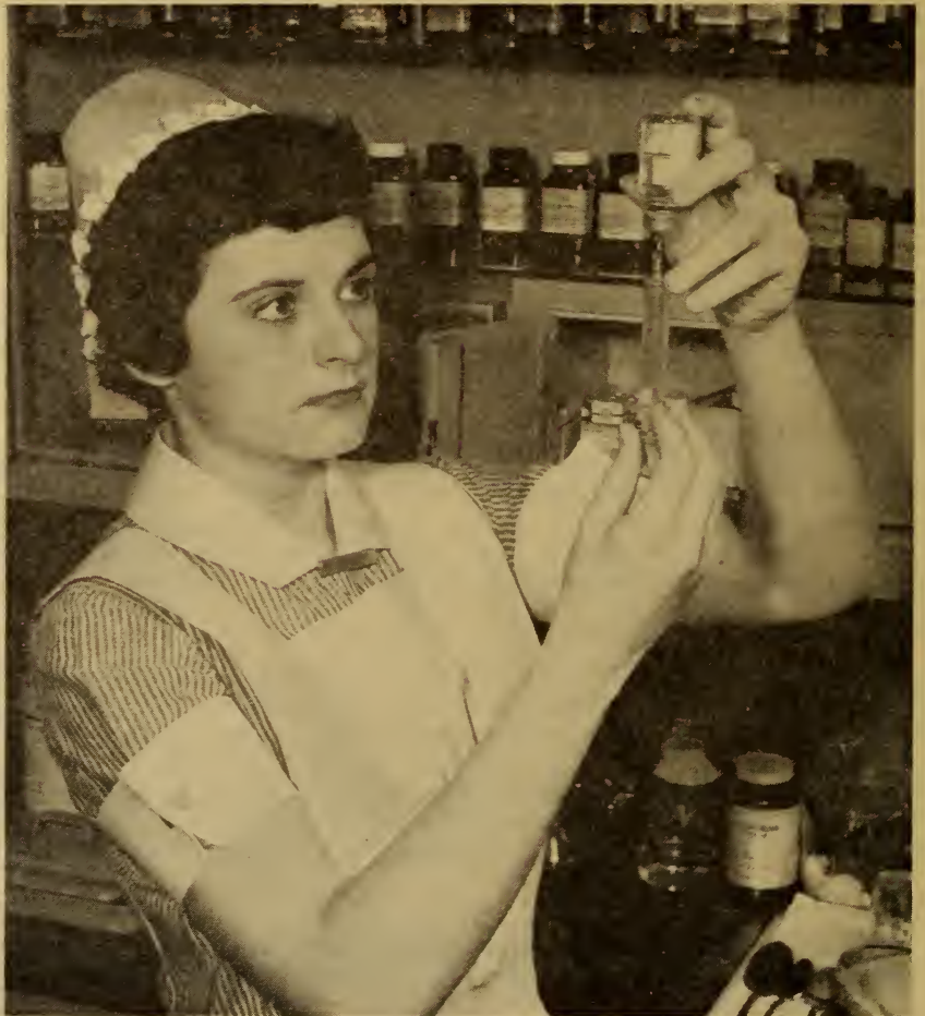
The Importance of Drug Therapy is stressed throughout in both programs.