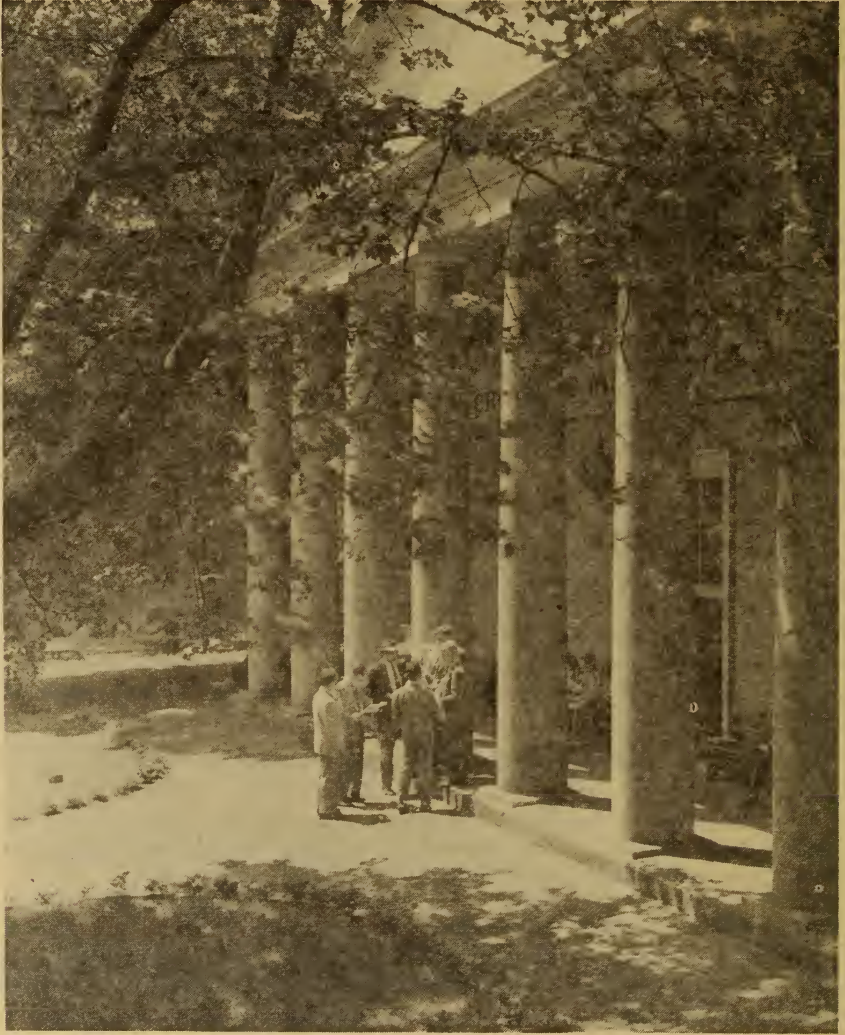
School of Medicine (This building, erected in 1812, is still in use.)