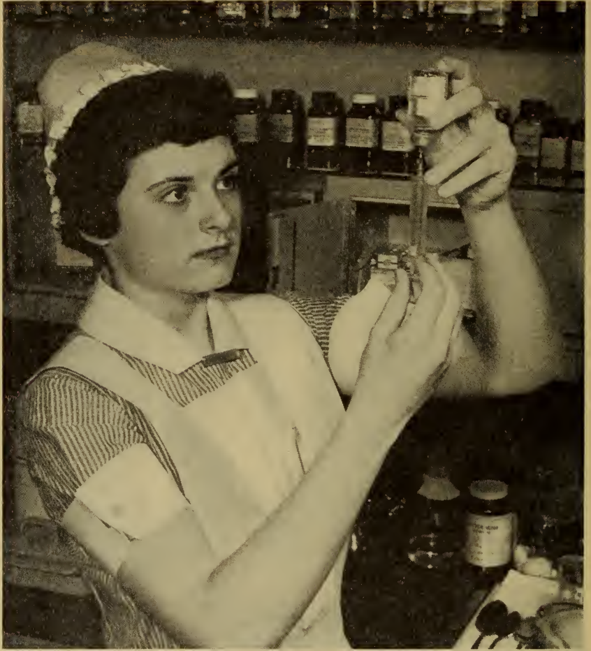
The Importance of Drug Therapy is stressed throughout in both programs.