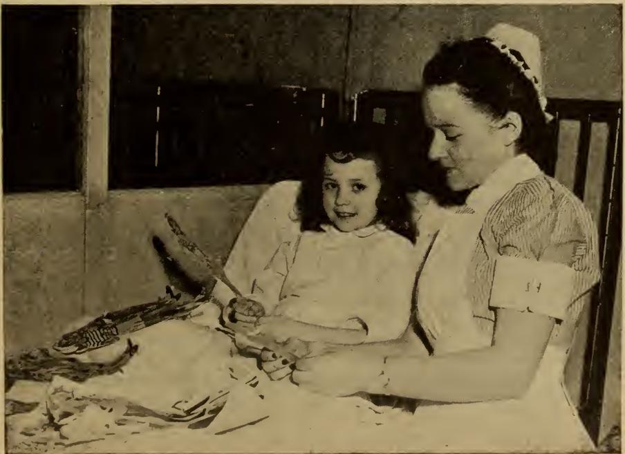
Helping a sick youngster to feel like smiling again is a challenging nursing goal.